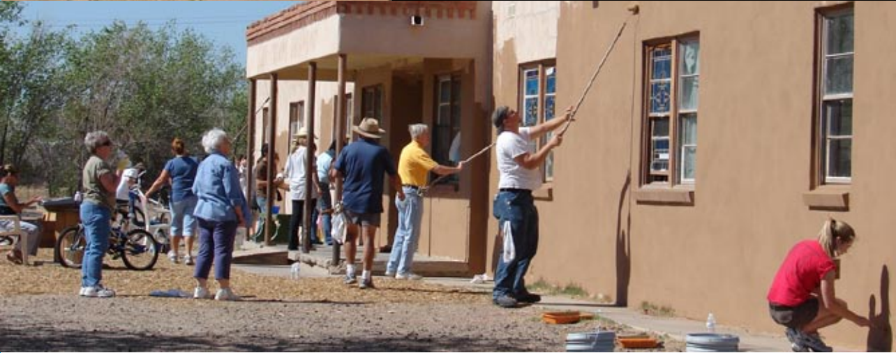
Sagebrush Community Church members volunteer their time at Joy Junction